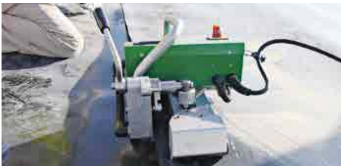
Fast and perfect!