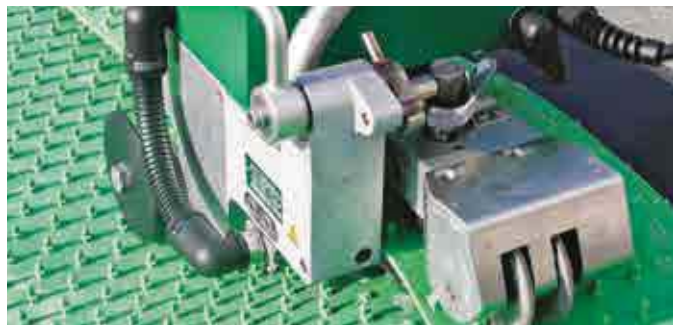
ASTRO CPL special version for concrete protective liners.