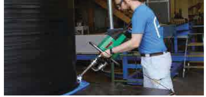
The WELDPLAST S6 is guided easily with the practical control wheel grip.

WELDPLAST S6 is the world's highest rated handheld extrusion welder. With an output of 6 kg/hr, it is surprisingly maneuverable. It features a brushless, preheat motor, multifunction display and comfortable ergo-grip – making the S6 Leister's flagship extrusion welder.